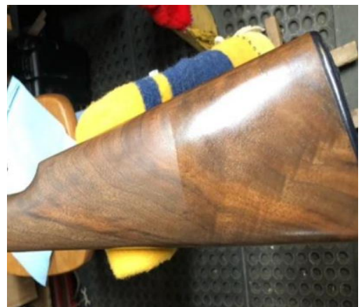
Snake Oil applied to right half of stock

Old West Snake Oil is available from the C. Sharps showroom info@csharpsarms.com or through Ironhorse Industries, P.O. Box 251 Fort Collins CO 80522, tel. 303-475-8044, email oldwestsnakeoil@gmail.com or website www.oldwestsnakeoil.com . Prices for No. 1 in an 8-oz bottle are $20, while for the No. 2 in 4-oz bottle $16. Prices do not include shipping.