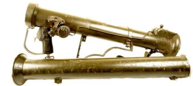
M20a1B1 Super-bazooka, barrel disassembled

The M20 Super-Bazooka antitank rocket launchers were fitted with folding reflecting optical sight installed on the left side of the barrel tube. The Super-Bazooka could be fired off the shoulder, with the skeletonized shoulder stock attached below the rear part of the barrel, and an optional folding bipod could have been fitted to fire weapon from prone or a supported position. Some Super-Bazooka launchers were also provided with a retractable support monopod, located in front of the shoulder stock.