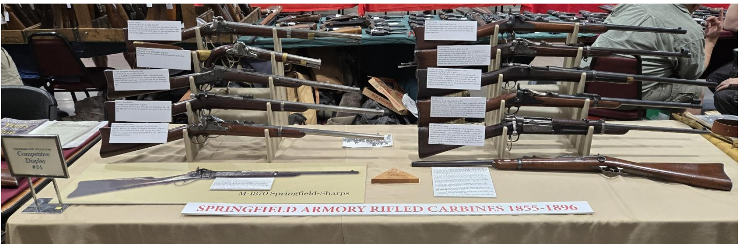
Springfield Rifled Carbines – Hunley