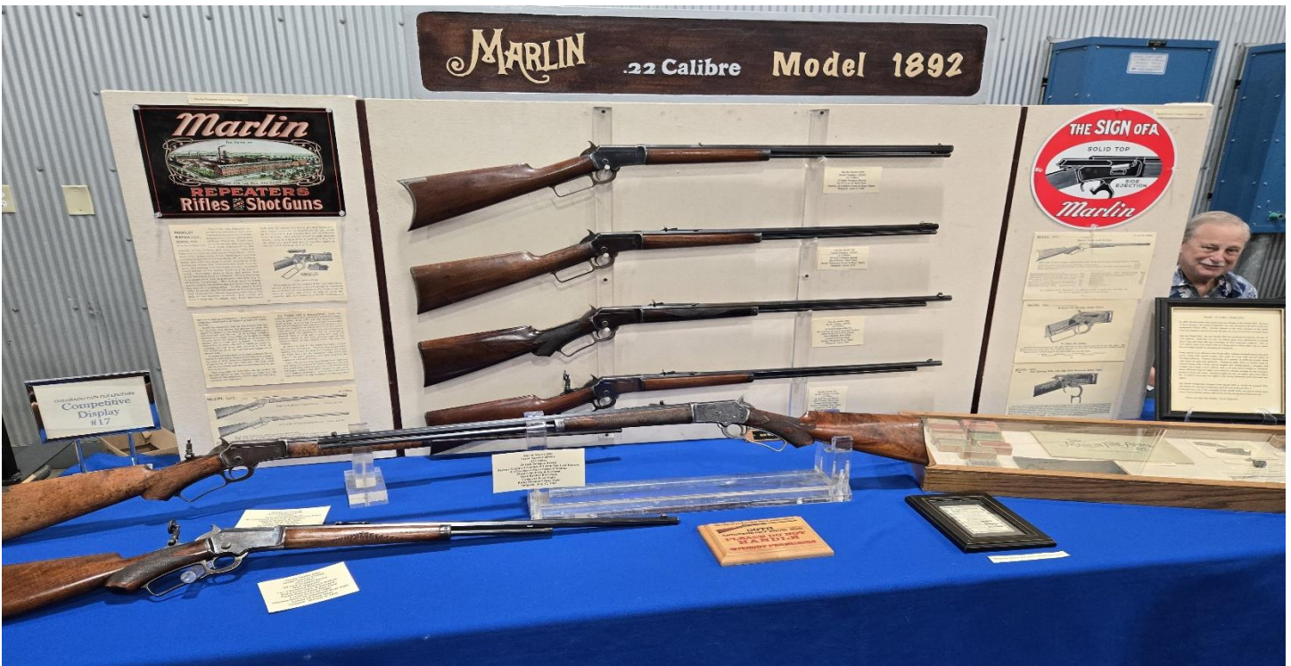
Marlin .22 Calibre Model 1892 - Regnier