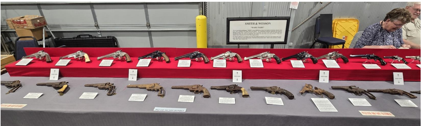
Smith & Wesson Rare Pairs - Mower