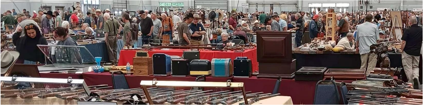
Lots to see.