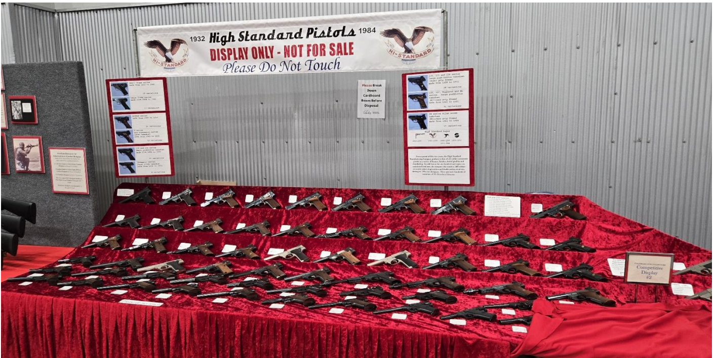
High Standard Pistols – Hooper