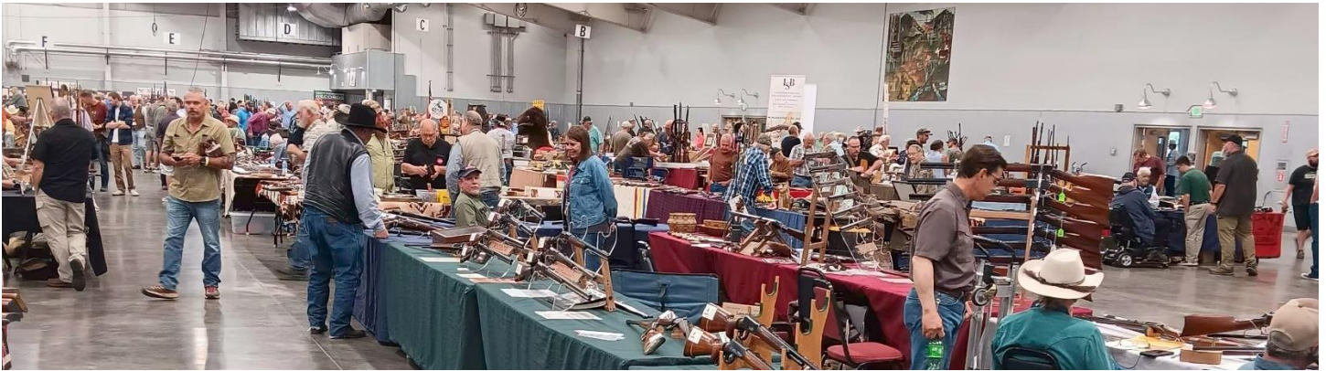
Lots of displays and lots of people to look.