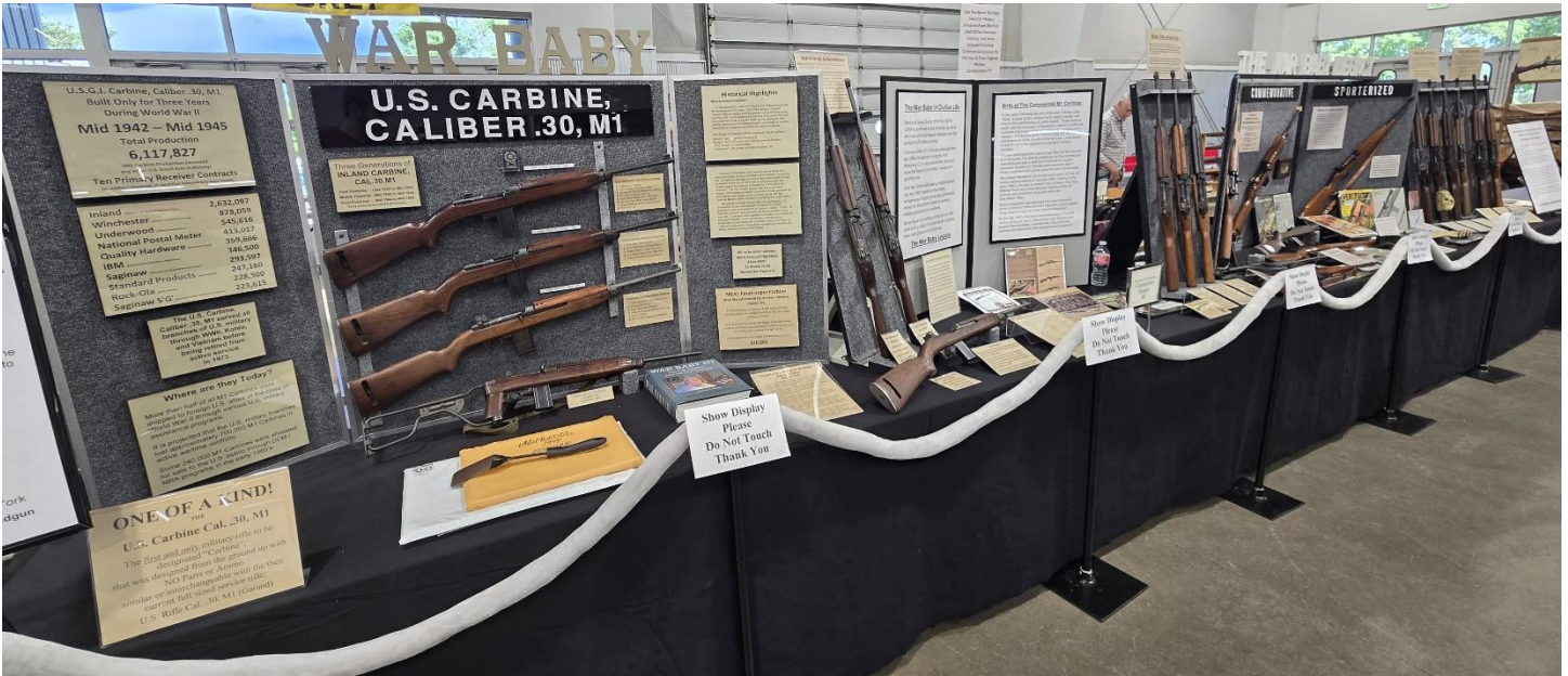
War Baby – Goodwin