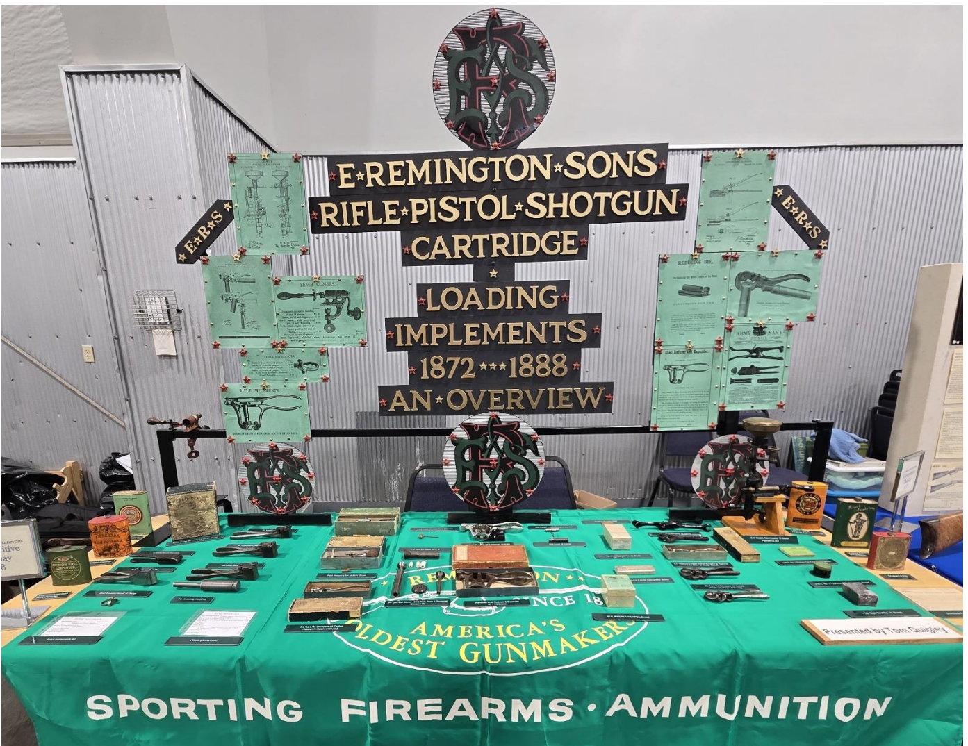
E- Remington Sons Cartridge Loading Implements – Quigley